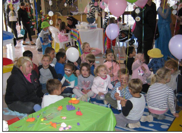
Celebrating over 30 years of Service since 1986