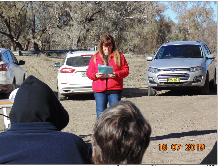
Celebrating over 30 years of Service since 1986