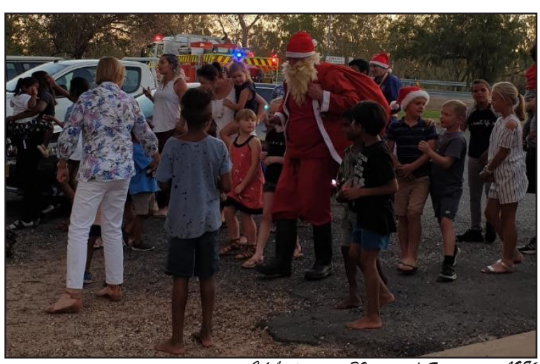
Celebrating over 30 years of Service since 1986